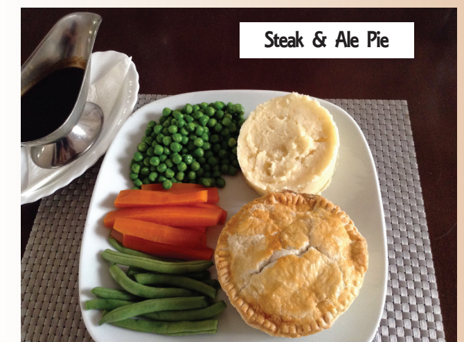
Steak & Ale Pie