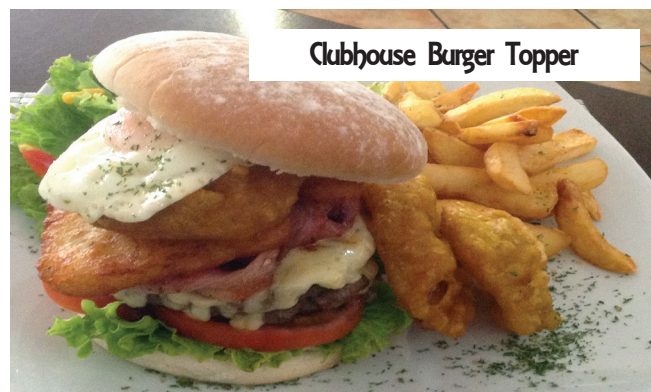
Clubhouse Burger Topper

The Choice of Cheese, Bacon, Egg, Chilli, Pineapple, Onion Rings, Hash Browns or Blue Cheese. Toppings €1.00 each.