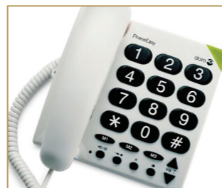
PhoneEasy Phone (Large Buttons)