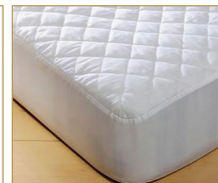
Single/Double Mattress Protectors