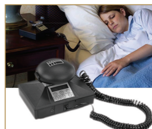
Vibrating Pillow (Deafguard Alarm)