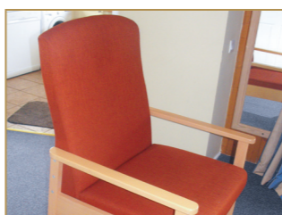
High Backed Chair