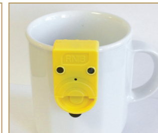
Level Fill Alert Device