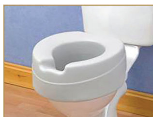
Toilet Seat Riser