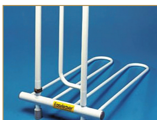
Bed Grab Rail