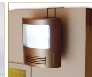
Flashing Door Bell