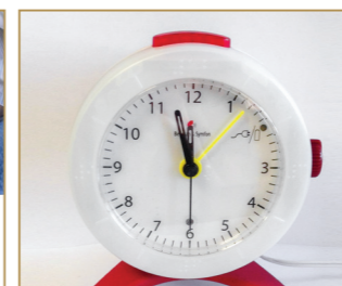
Flashing Alarm Clock